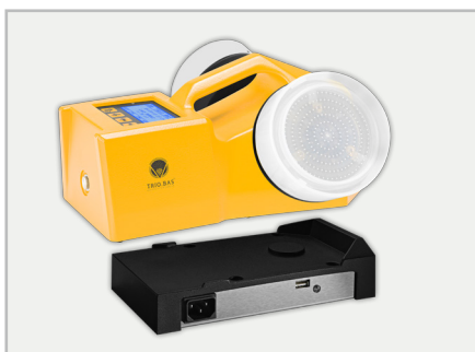
TRIO.BAS DUO with induction battery charger

(*) each PACK consists of: 1 TRIO.BAS DUO and 1 calibration certificate, 1 base station induction charger, 2 s/s ASPI head with s/s cover head, 1 robustus carrying case.