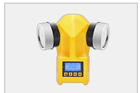
Stable on a work surface in a vertical position