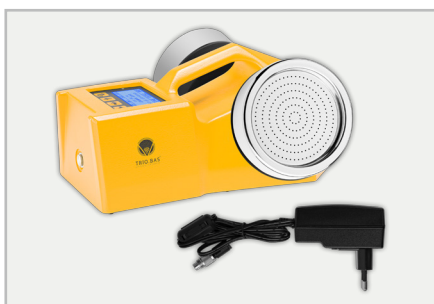
TRIO.BAS DUO with cable

(*) each PACK consists of: 1 TRIO.BAS DUO with battery charger, 1 calibration certificate, 2 s/s ASPI head with s/s cover head, 1 cable for transfer data, 1 robustus carrying case.