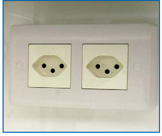
Optional internal country-specific mains power sockets