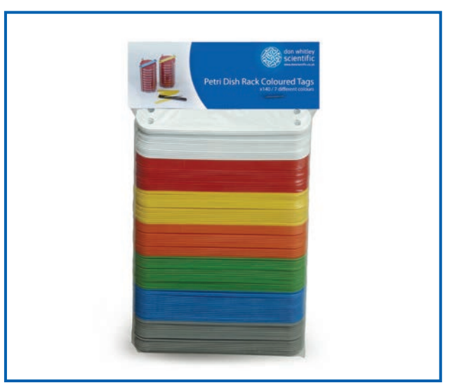
Petri Dish Rack Coloured Tags