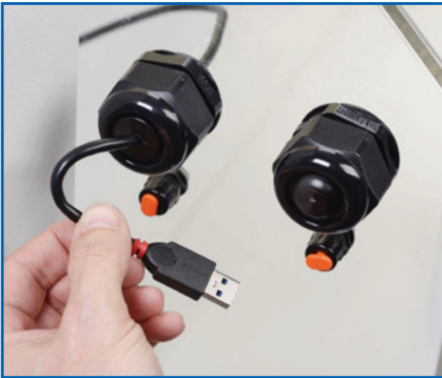
Large and small cable glands can be incorporated.