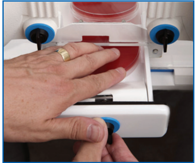
9cm Letterbox - Ideal for introducing individual samples quickly.