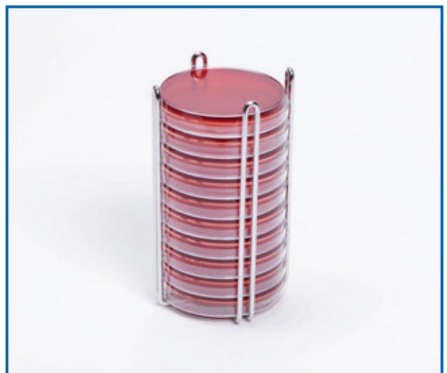
10 plate petri dish rack.