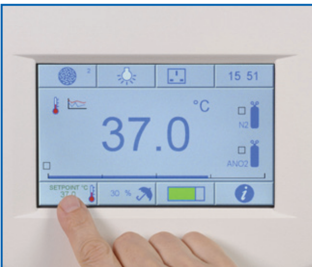
Intuitive operational software accessed via a full colour touch screen interface