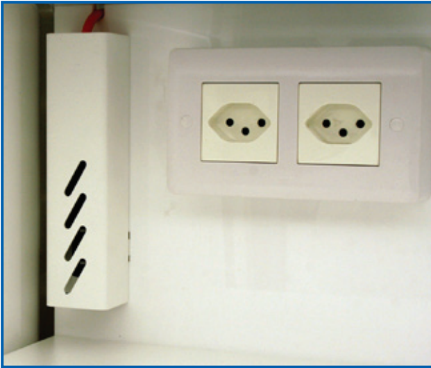
Optional internal country-specific mains power sockets